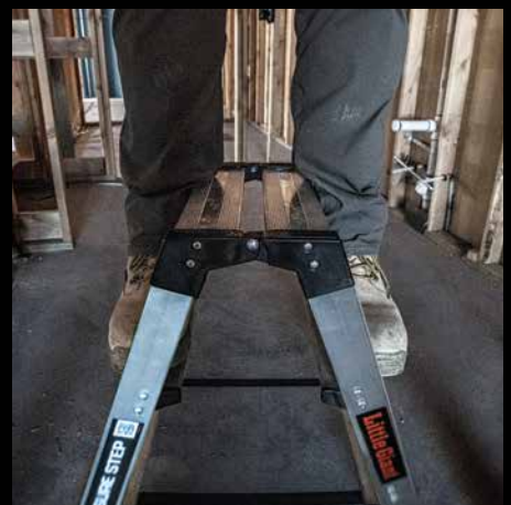
Comfortable to Straddle*