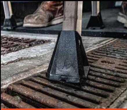
Heavy-Duty Oversized Feet