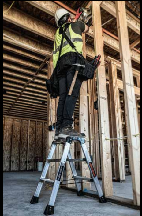
Stable Standing Surface