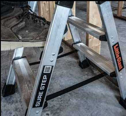
Quick Setup with Spreader Straps