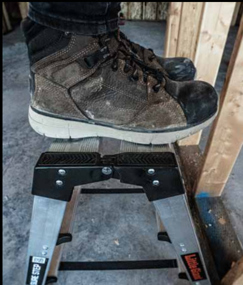
Wide Steps with Ridged Traction