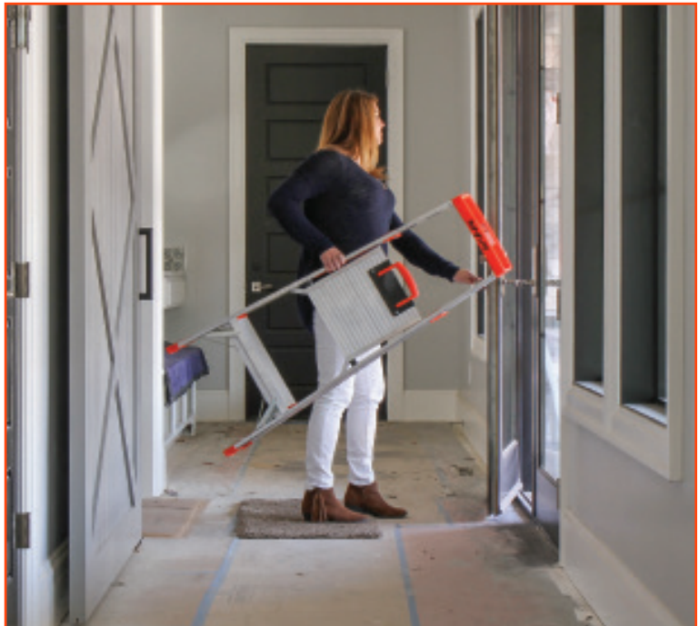
LIGHT WEIGHT AND EASY TO STORE AND CARRY