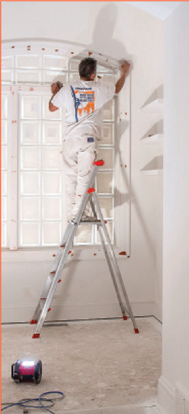
EXTRA WIDE, HEAVY DUTY, STANDING PLATFORM