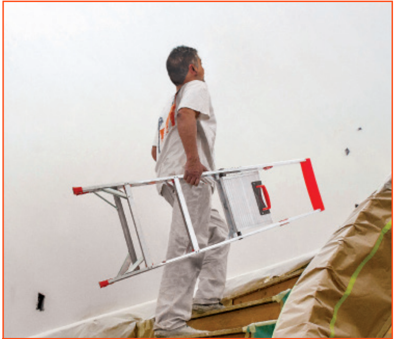
RATED TO HOLD 300 LBS