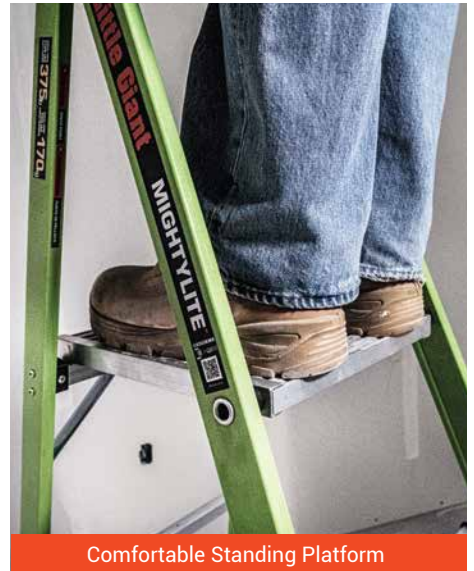
Comfortable Standing Platform