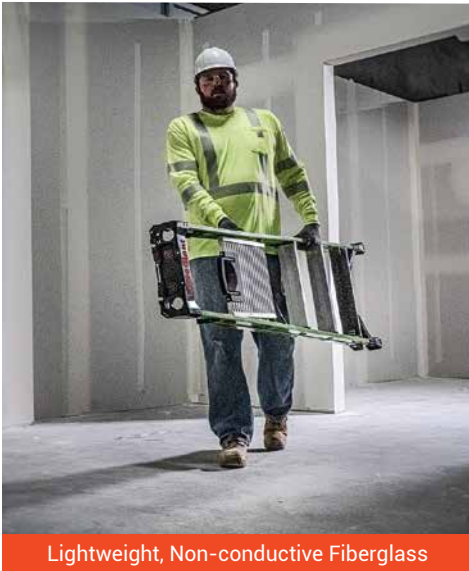
Lightweight, Non-conductive Fiberglass