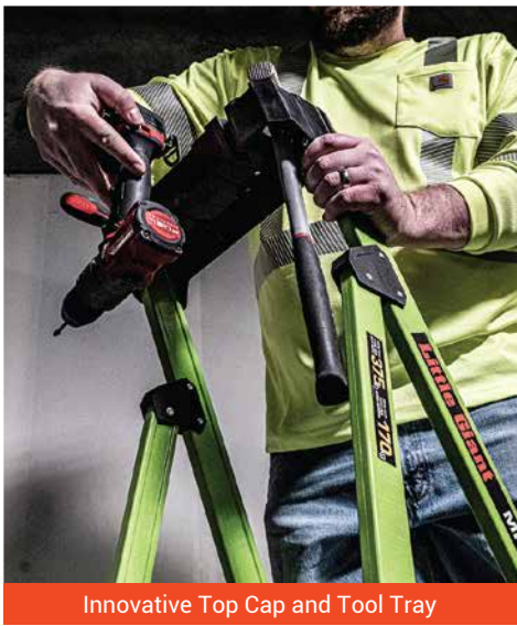
Innovative Top Cap and Tool Tray