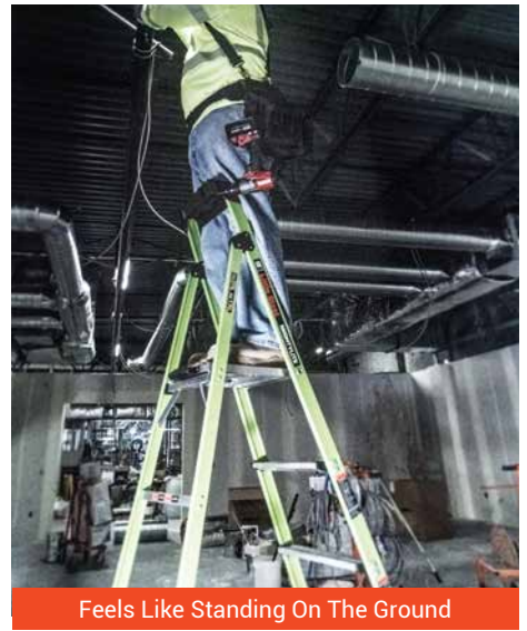
Feels Like Standing On The Ground