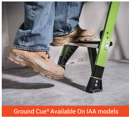
Ground Cue® Available On IAA models